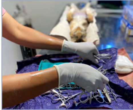
Keeping it hygienic.