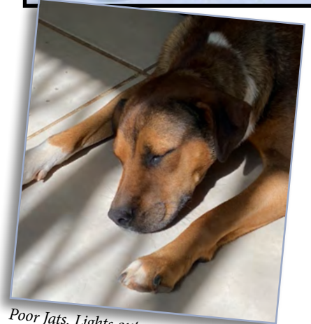
Poor Jats. Lights out.